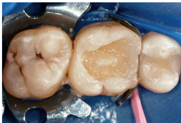
Fig 7 Dentin stratification was performed placing A4 to A1 shades.

Restorations were evaluated after 6 months and one year using modified USPHS criteria by two independent evaluators; USPHS criteria were adjusted to test direct fiber-reinforced restorations by including post, root canal, and periapically related factors (Table 3). Pictures were taken at each recall (Fig 11).