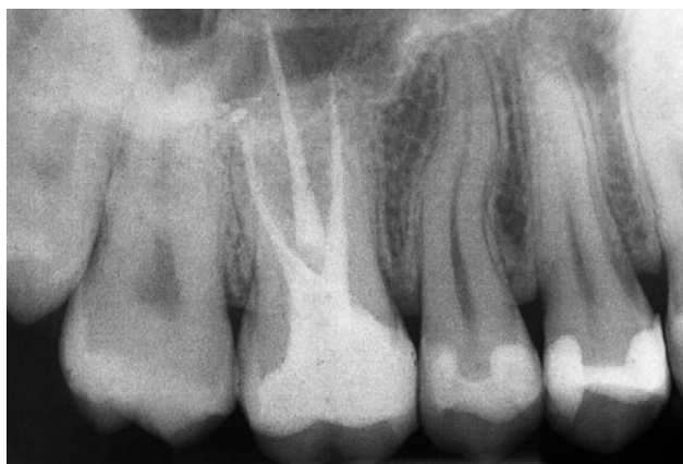
Fig 10 Radiographic image of tooth 26 at the one-year recall.