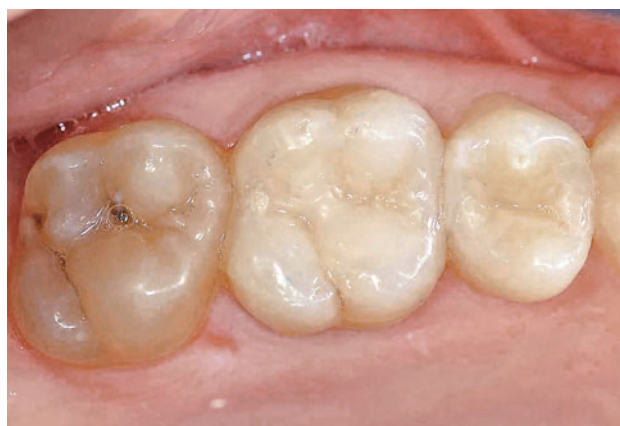
Fig 9 Postoperative occlusal view of the final restoration following endodontic and restorative treatments.