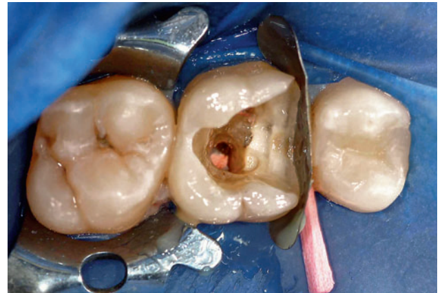
Fig 4 A filled ethanol-based adhesive system was applied on both enamel and dentin.