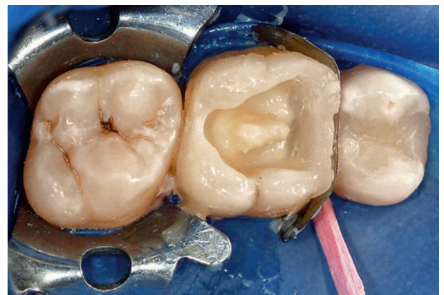
Fig 6 A piece of Ribbond fiber was wetted with unfilled resin, covered with flowable composite and inserted into the palatal canal.