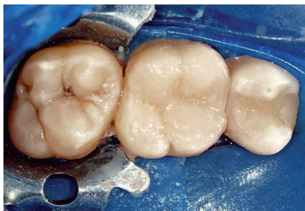
Fig 8 Restoration was completed with the application of PF/PN shade to the final contour of the occlusal surface.