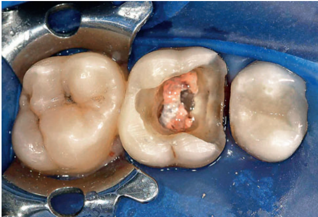
Fig 1 Occlusal view of tooth 26 after placing rubber-dam, preparing cavity, and removing provisional restoration.