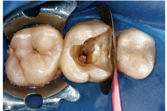
Fig 2 Three to 4 mm of gutta-percha were removed from the palatal root canal and a sectional matrix was placed.