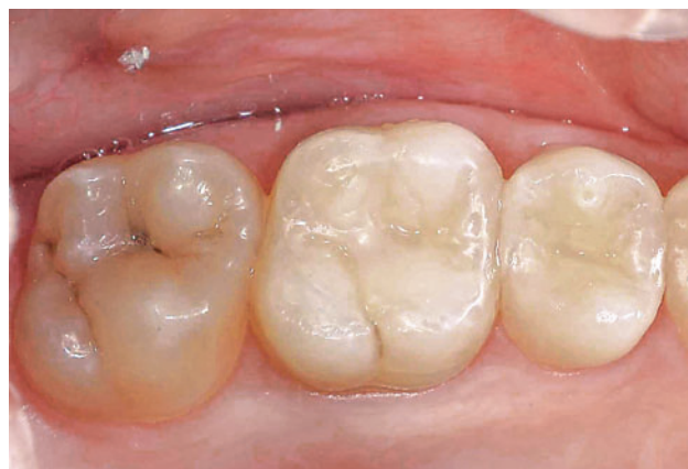
Fig 11 Clinical image of tooth 26 at the one-year recall.