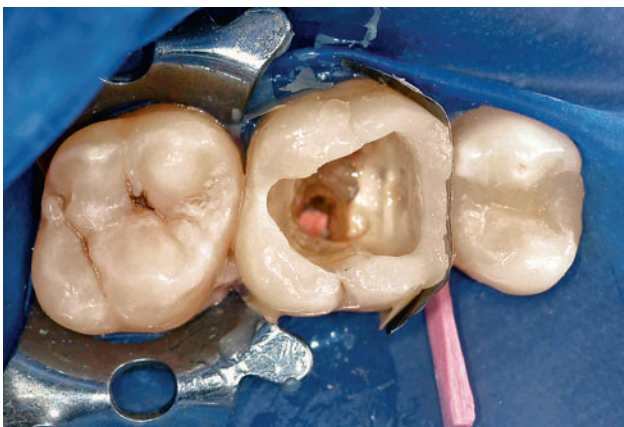
Fig 5 The peripheral enamel skeleton was built up using wedge-shaped increments of PA and PS shades.